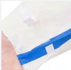
Double-sided tape around the wrists Helps keep gloves in place.