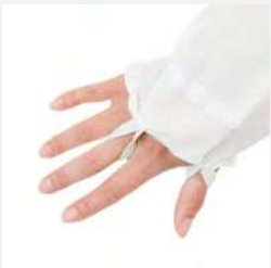
Thumb & Finger Loops Prevents sleeves from riding up to prevent skin exposure.