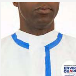
Mandarin collar with Velcro closure Adjustable collar creates a better seal around the neck.