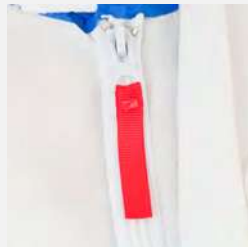
Large zipper pull with red fabric pull tab Easier to see and grab.