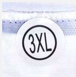
Visible sizing tag Helps materials management teams identify size easily when suits are removed from the box.